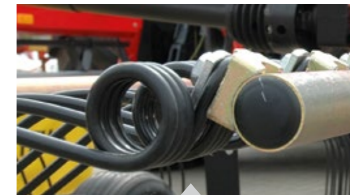
Absolutely smooth front side of the tine arm

The linear height adjustment, which is fitted as standard, can very easily and conveniently adapt to the working height and your ground conditions.