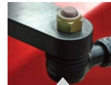
Adjustable track rod head

In this way, the tines are prevented from penetrating into the ground. No penetration, no damage to the sward, no forage contamination – top quality forage.