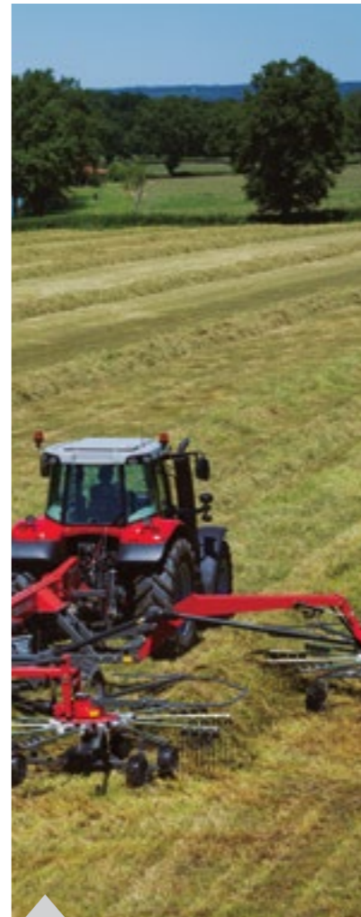
Page 12 Specifications