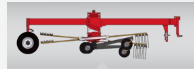
Patented, fully cardanic rotor suspension