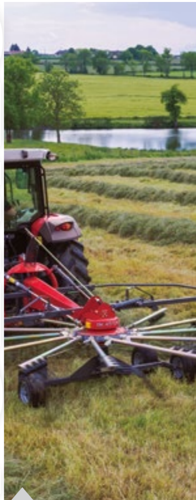
Page 05 Three-point attachment equipment