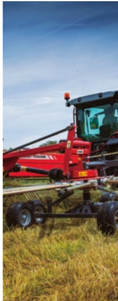
Page 07 MF Two-rotor and four-rotor rakes