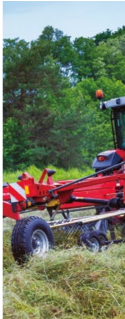
Page 08 MF Two-rotor central delivery rakes with transport chassis