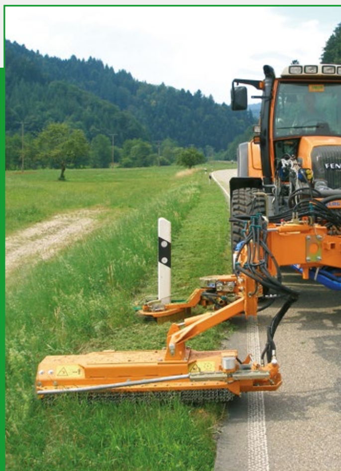
Verge mower and reflexion post mower in detail.

© MULAG Fahrzeugwerk Heinz Wössner GmbH u. Co. KG // Changes without notice. Dok.0715_341au