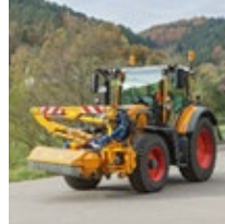
MFK 500 transport

Thanks to its lateral shift and its geometry the MFK 500 is suitable for mowing and working close to the roadside as well as behind crash barriers. An optional telescopic arm increases its reach, e.g. for hedge cutting.