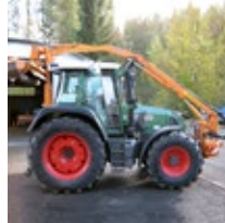
FME 500 transport

The FME 500 with its reach up to 6.50 m is parked in transport position at the rear behind the cab on a parking frame. This configuration provides a balanced weight distribution on the vehicle axles.