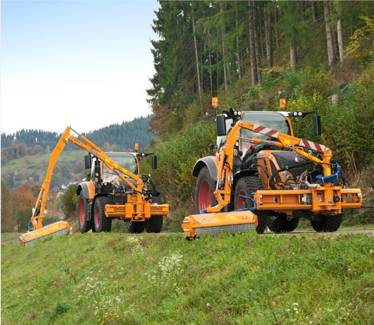
MFK 500 and FME 600 in combination.