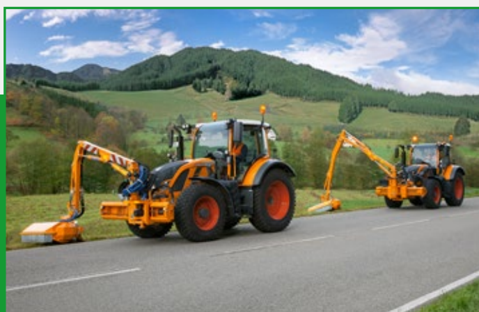
MFK 500 and FME 600 in combination.