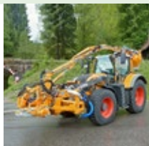
MKM 700 transport

The optimal geometry of the boom system makes it easy for the MKM 700 to avoid obstacles such as traffic signs up to 2.9 m and enables quick mowing work.