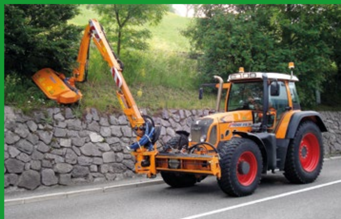
MFK 500 clearing the ground on top of a wall.