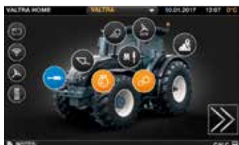
Easy to navigate menu structure.

Valtra SmartTouch has raised usability to the new level. It's more intuitive than your SmartPhone. Settings are easily accessible within only two taps or swipes and all technology is integrated in to the new easy-to-use format: Guidance, ISOBUS, Telemetry, AgControl and TaskDoc.