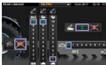
Intuitive way to set up settings with large controls and easy to understand functions.