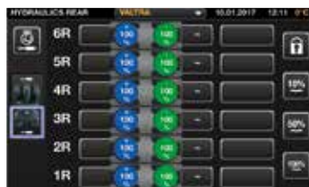
Easy configuration of worklights from the terminal. Worklights on/off switch in the armrest with beacon on/off switch.