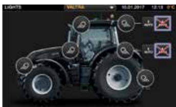
From any control you can control any hydraulic service including hydraulic valves (front and rear), linkages (front and rear) or front loader