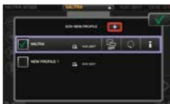
Profiles for operators and implements which can be easily changed from any screen menu. All the setting changes will be saved in the selected profile