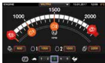
Logical to set up settings with swipe gestures. All settings are automatically stored in memory.