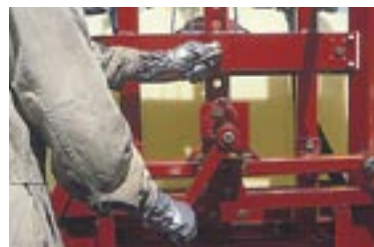
Manual boom lift