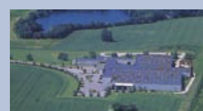
Hoje Taastrup, Denmark