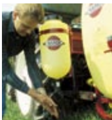
15 l Clean water tank