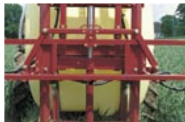
Hydraulic boom lift