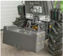
□ The front-end weight provides for a better powertrain function on the front axle.