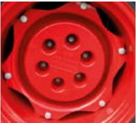
□ Additional wheel weights increase the rear axle traction.