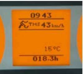
■ The temperature gauge always provides you with reliable information on the outside conditions.