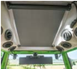
■ The roof window's sun shade protects against dazzling sunlight.