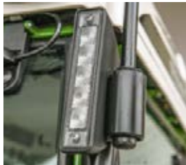
□ The indicator and clearance lights are neatly integrated into the A-pillar.