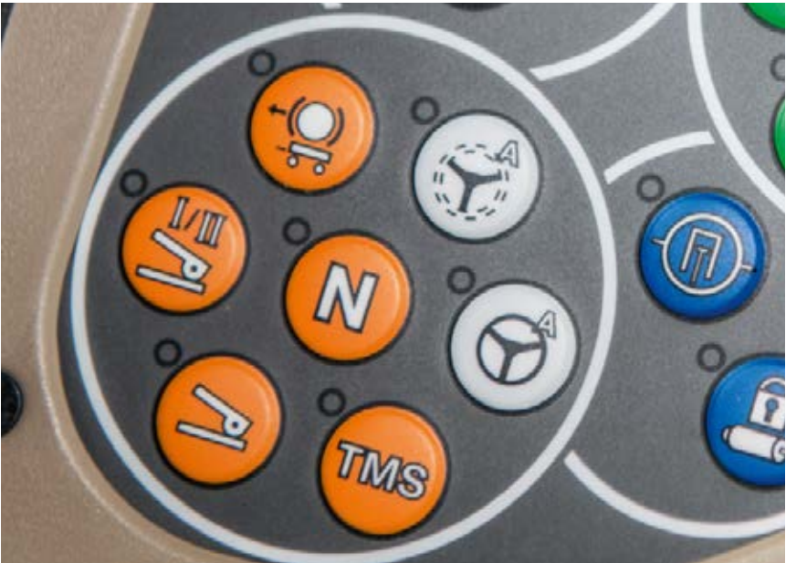
■ The different driving strategies can be conveniently pre-selected at the touch of a button.