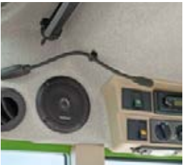
□ Clear, interference-free phone calls can be made via Bluetooth using the hands-free speaking system.