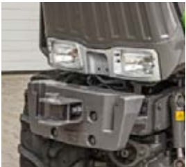
□ Without the front linkage, there is an option to fasten additional ballast directly onto the frame.