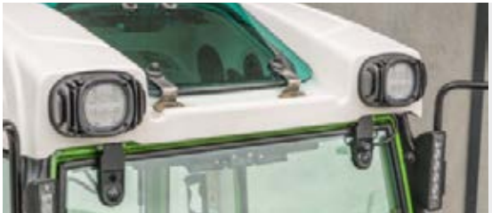
□ Bright LED work lights in the front roof section have a long range.