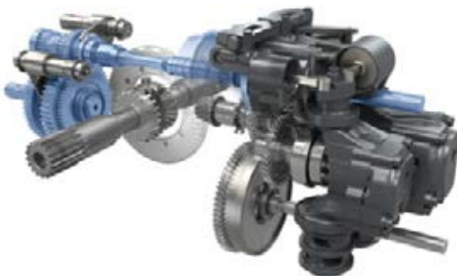
The direct through drive of the PTO ensures excellent efficiency. Speed is reduced directly on the PTO stub.

for the PTO can be conveniently pre-selected using buttons: 540, 540E/750 and 1000 rpm are available in the rear (ground PTO optional). The external controls at the rear are extremely practical. The Fendt 200 Vario PTOs feature outstanding efficiency, since the flow of power to the PTO stub flows through a direct drive line from the Vario transmission. A 540E (750 rpm/min at the rated engine speed) or 1000 PTO is available for the front mount.