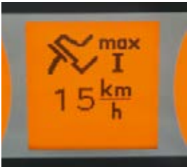
■ The driving pedal sensitivity can be adjusted for even more precise work.