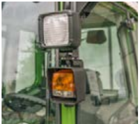
□ Integrated work lights in the A-pillar supply additional illumination of your surroundings and protect your crops