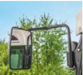
■ The side mirrors can simply be folded in.