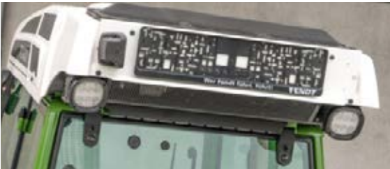
□ Retain an overview of the implements at the back of the roof with the LED work lights.