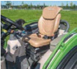
■ The synthetic leather seat is water and dirt-repellent and is a perfect match for models without a roof.