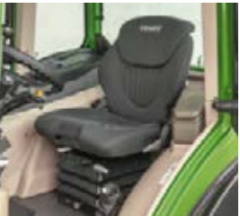
□ The fabric driver's seat is comfortably sprung.