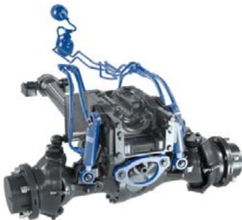
Front axle suspension with levelling box and anti-roll control. Safe driving, especially with heavy front-mounted implements. Full traction in any situation.

The intelligent combination of three systems guarantees maximum ride and operating comfort: the self-levelling front axle suspension with anti-roll control, the cab on silent bearings and the active shock load stabilising. The suspension does a great job of minimising jolts and unevenness on the road and in the fields. Self-levelling provides a consistently high level of ride comfort even with high payloads.