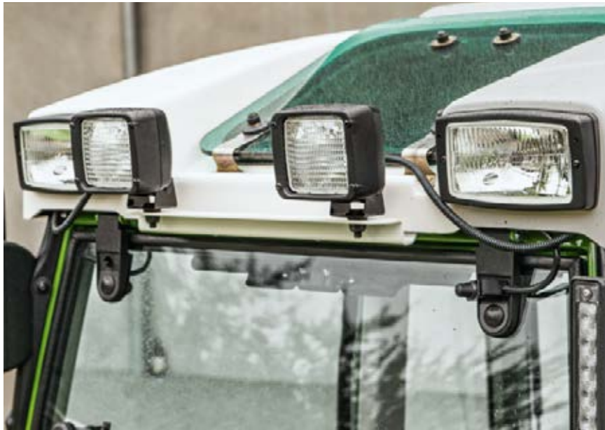
□ Two work lights can also be fitted at the front in the version with auxiliary headlights.