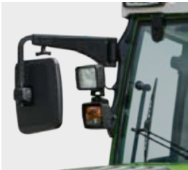
□ On request, the side rear view mirrors can be fitted in a detachable version.