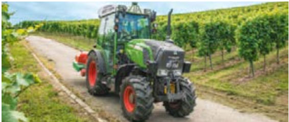
■ The reaction steering system ensures a safe ride on the roads.