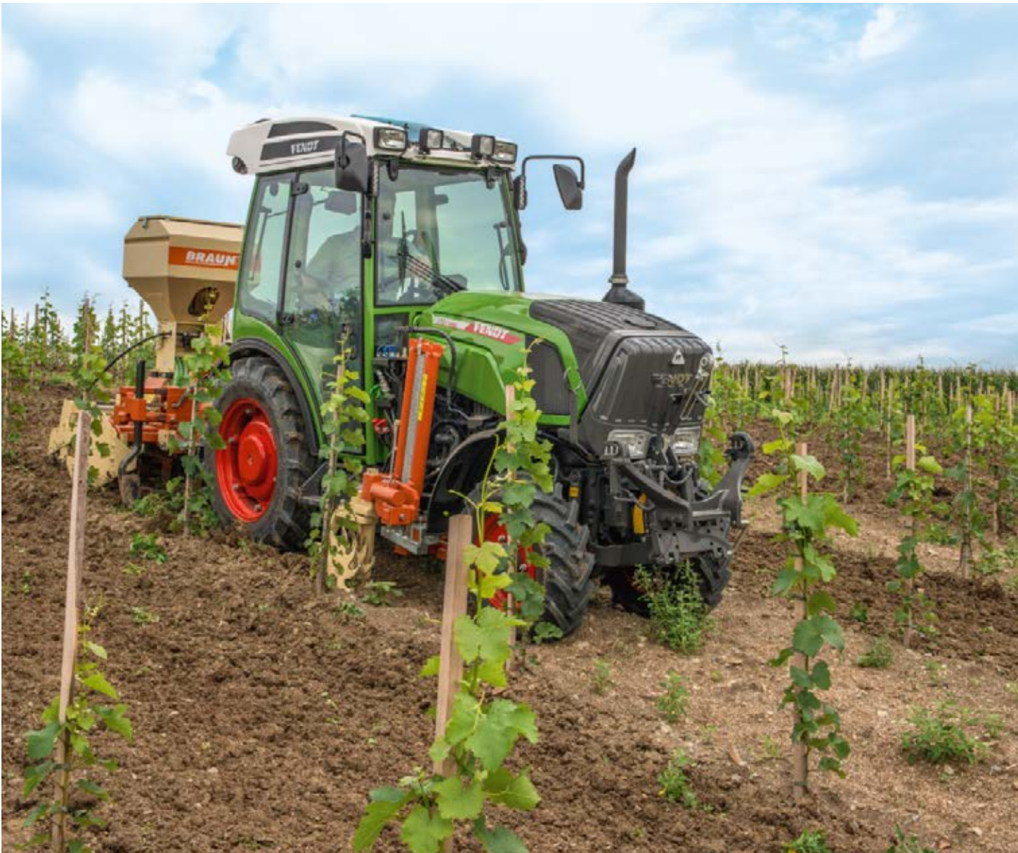
Soil protection is a combination of many factors: Swinging power lifts with a traction point at the front, 4WD and automatic differential lock, levelling box and anti-roll control on the front axle. Optimal traction under any conditions.