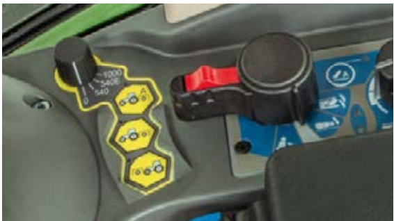
Handy PTO comfort switch with automatic function in the armrest.