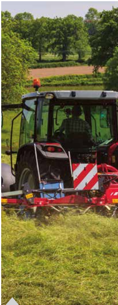
Page 04 Massey Ferguson TD Series Tedders