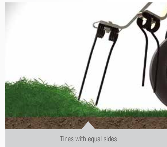
Tines with equal sides