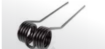
Massey Ferguson Super C quality tines