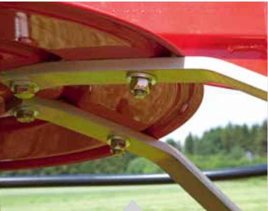
Wide contact surface for optimum power transmission