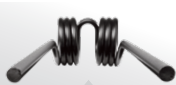
9.5 mm tine diameter

The Super C tine has a tine diameter of 9.5 mm, a coil diameter of 70 mm and six windings, making it one of the most efficient on the market and typical of the high quality of each and every Massey Ferguson hay tedder.