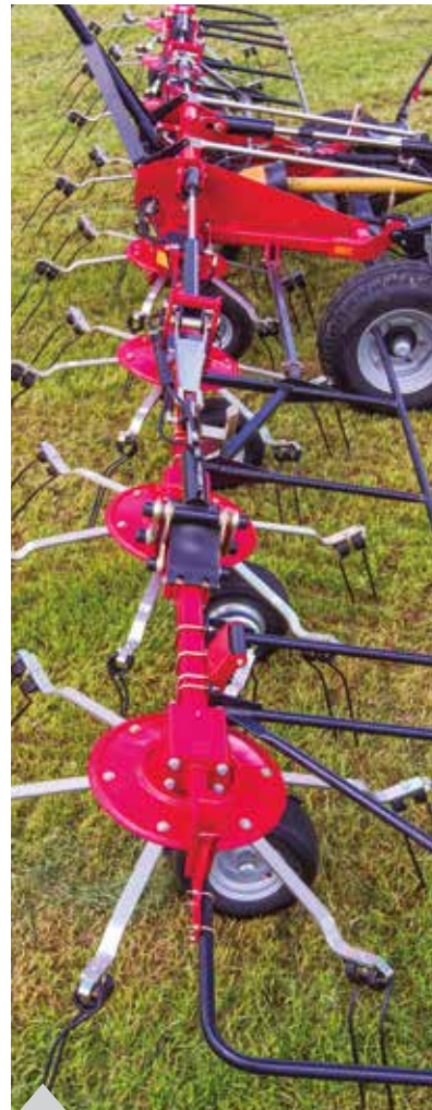
Page 08 MF Hay Tedders trailed and with transport chassis