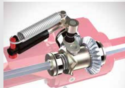
Security Lock System