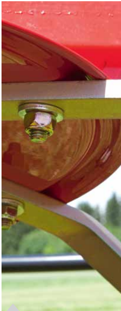
Page 07 Best harvest - fast and low-impact