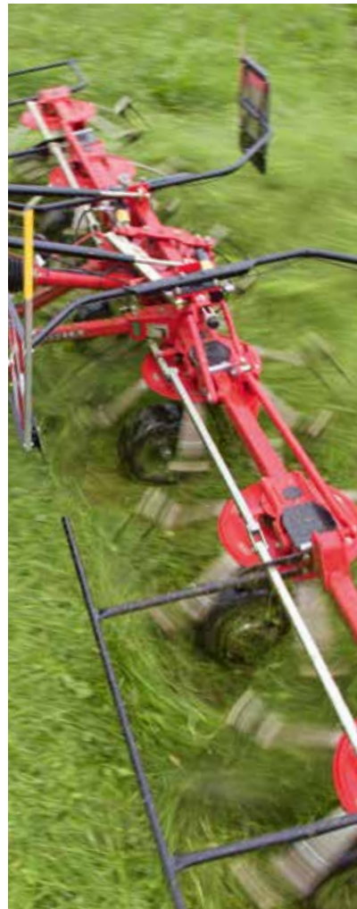
Page 06 Forage quality features