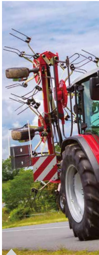
Page 10 Specifications