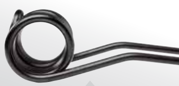
70 mm coil diameter